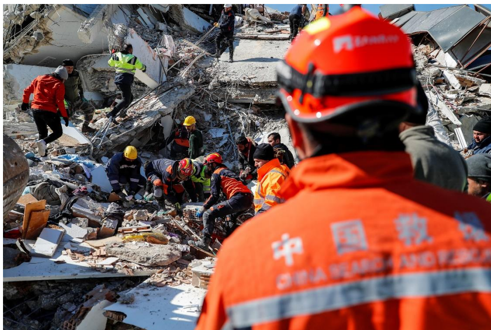
Members of search-and-rescue teams work at the site of a collapsed building in Hatay on February 9.

as the White Helmets, warned that the hope of finding survivors is now fading inside Syria.