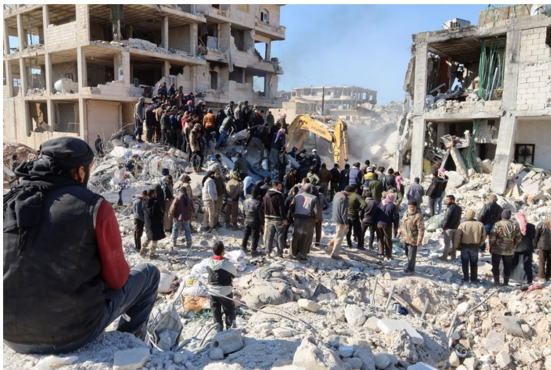
Rescue workers look for survivors amid the rubble of a building in Jindayris, Syria on February 9.

Some rescues reported days after quake rocked parts of Syria and Turkey – but death toll is steadily climbing