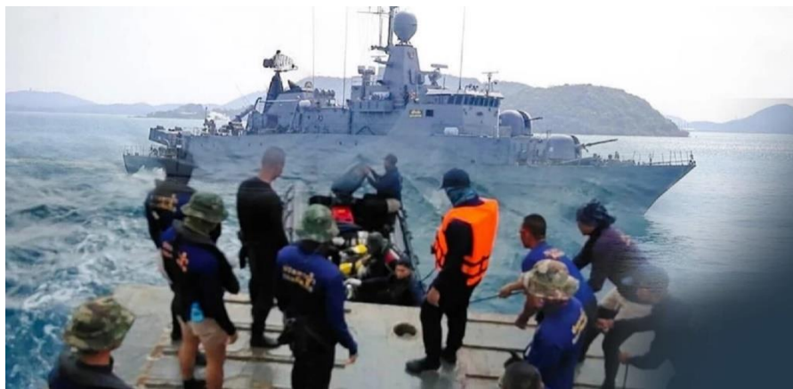
Divers search for missing persons from the royal ship Sukhothai wreck.