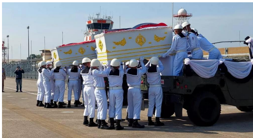
Navy moves bodies Royal Admiral Sukhothai return home.

Summary of victim assistance (December 29, 2022) Total of 105 personnel, 76 survivors, 24 dead, of which 23 can be identified by name and there is evidence indicating that they are army personnel. boat and in the process of identity verification to confirm the identity of 1 officers, leaving 5 missing persons.