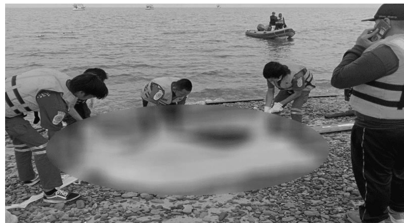
The deceased's body was found, dressed in a sukhothai naval force.